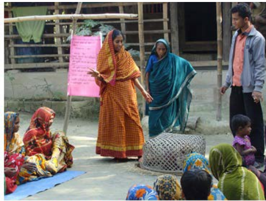
In course of time, local farmers also developed their expertise and started facilitating the season-long FFS sessions - became known as Local Facilitators (LF)

The results of the Impact Study demonstrated clearly that the participating farmers had gained a very good knowledge on various farming aspects from the FFS. Consequently their vegetable, livestock, poultry, and fisheries production also increased compared to the pre-project situation that ultimately contributed to their higher annual income.